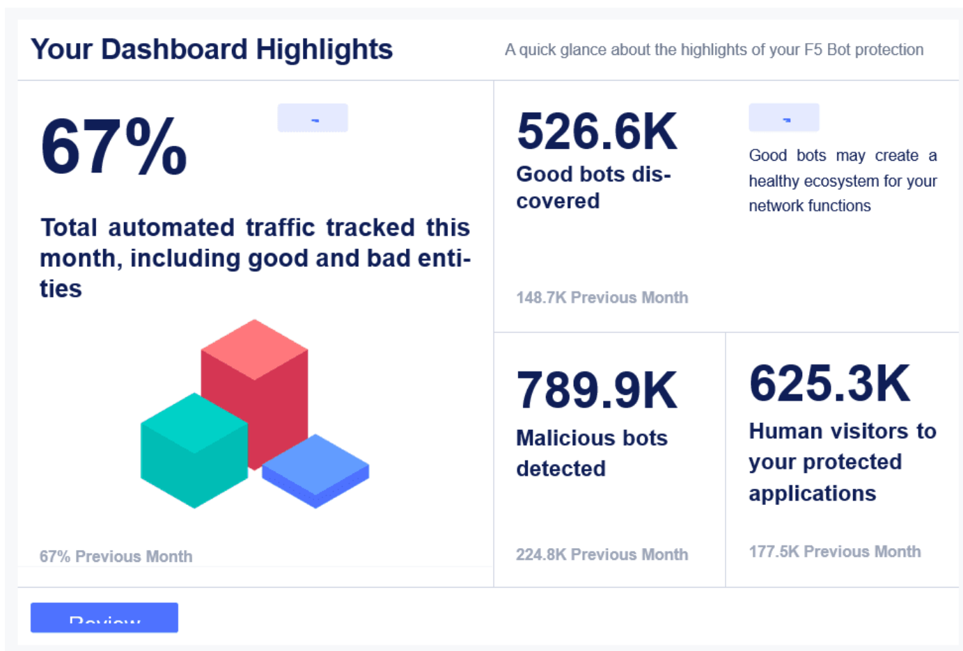
Figure: Dashboard displaying percentage of bots within overall traffic, numbers of good bots, bad bots, and human visitors.

The Automated Threat Briefings (ATB) available to customers of Bot Defense are now available for self-service sign up within the native Distributed Cloud report scheduling system, which makes it easier for customers to configure their reporting preferences in one location. The ATB reports provide a visually compelling summary of bot and human traffic over the month broken down by types of good and malicious bots.